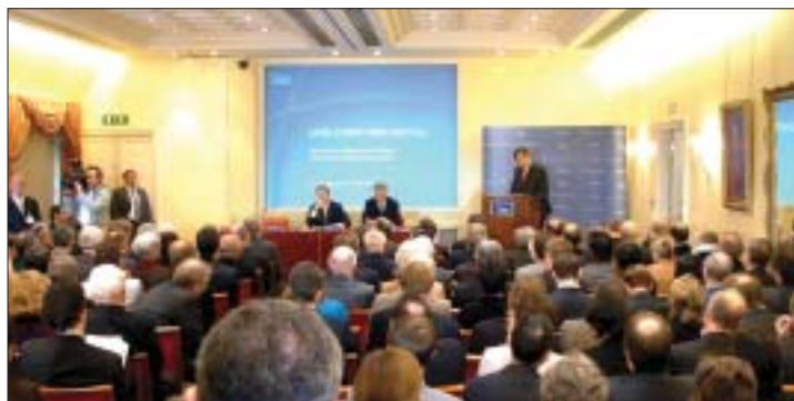
Members and press attend the 2003 Alastair Buchan Lecture at Arundel House