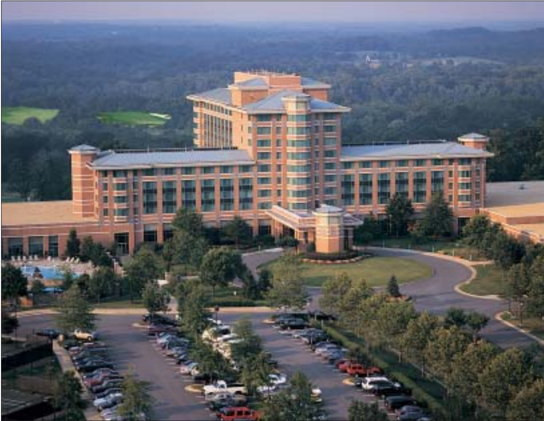
GSR 2003 will be held at the Lansdowne Resort from 12–14 September

As all members should have been advised, preparations are underway for GSR 2003 which this year will take place from 12–14 September at the Lansdowne Resort just outside Washington DC. This year the GSR will address three principal issues: the changing shape of the Middle East, proliferation of weapons of mass destruction and the debate over new strategic doctrines.