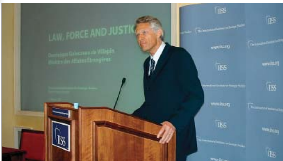
The 2003 Alastair Buchan Lecture, 'Law, Force and Justice', was delivered on 27 March by French Foreign Minister Dominique de Villepin

The IISS invited French Foreign Minister Dominique de Villepin to deliver the 2003 Alastair Buchan Lecture on Thursday, 27 March. Entitled 'Law, Force and Justice', the Foreign Minister's speech concen-