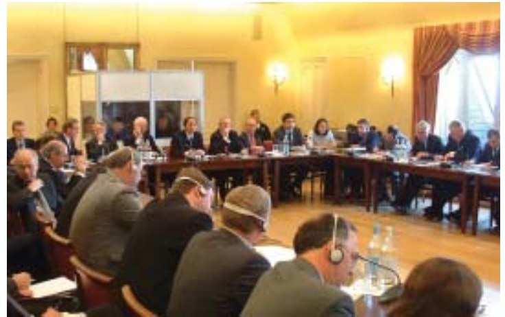
Conference participants from Armenia, Azerbaijan, Georgia, Bulgaria, Romania, Moldova, Turkey and Ukraine

The conference presented an opportunity for representatives of the Black Sea region countries, British and other participants to assess the impact of the US-led military campaign in Iraq on Black Sea regional security, focusing particularly on US relations with Turkey, geo-political and security challenges for the South Caucasus and implications for major regional infrastructure