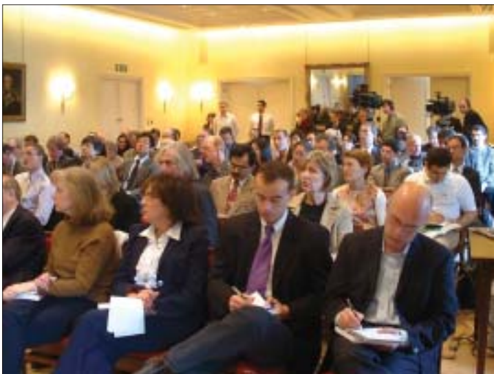
Strategic Survey 2002/3 generated extensive media coverage

in Iraq, post-war political and diplomatic challenges in the Gulf and the Middle East peace process.